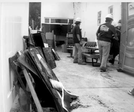
Outside the Harold Golen Gallery after the fire.

In the early hours of December 13, 2007, fire erupted in the Harold Golen Gallery in Miami, Florida. The fire was believed to have started when an advertising balloon attached to the gallery for Art Basel week came in contact with electrical wires overhead. Despite the intensity of the fire and the collapse of the ceiling, 178 Pop-Surrealist paintings were rescued from the building. Some of the works were charred beyond redemption, but 108 of the works were deemed potentially salvageable and were transported to the Florida branch of the Rustin Levenson Art Conservation Studio.