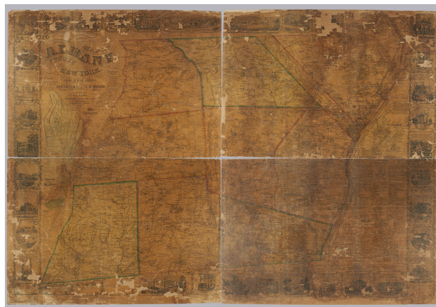
Fig. 1. Before treatment. Gould & Moore, Map of Albany County, New York , 1834, NYPL Map Division 16-5980.

The map section is transferred facedown on the nonwoven polyester to the suction table, where two layers of damp Evolon 2 have already been placed. As with most suction table treatments, plastic sheeting is placed around the object to concentrate the suction. The map section is sprayed with conditioned water repeatedly for about 20 minutes. At