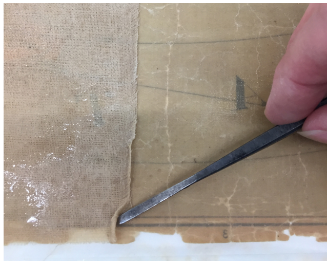
Fig. 3. Peeling the final layer of fabric. Detail of one quarter of J.B. Beers & Co., Kings and Queens Counties, New York , 1886, NYPL Map Division 16-5970.

The suction holds all of the fractured map pieces in place while peeling. When all of the fabric is finally removed, old adhesive is reduced from the verso by scraping with a spatula.