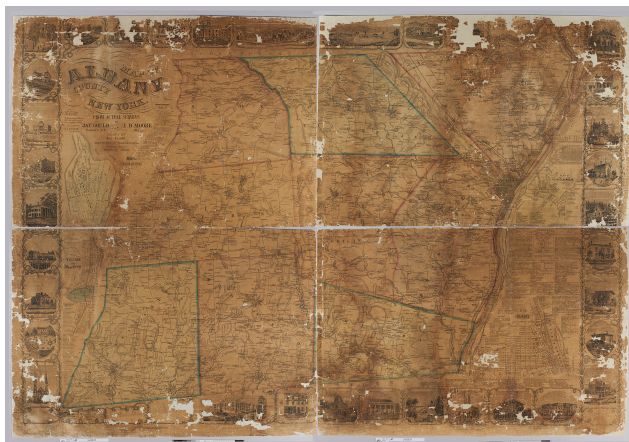
Fig. 5. After treatment. Gould & Moore, Map of Albany County, New York , 1834, NYPL Map Division 16-5980.