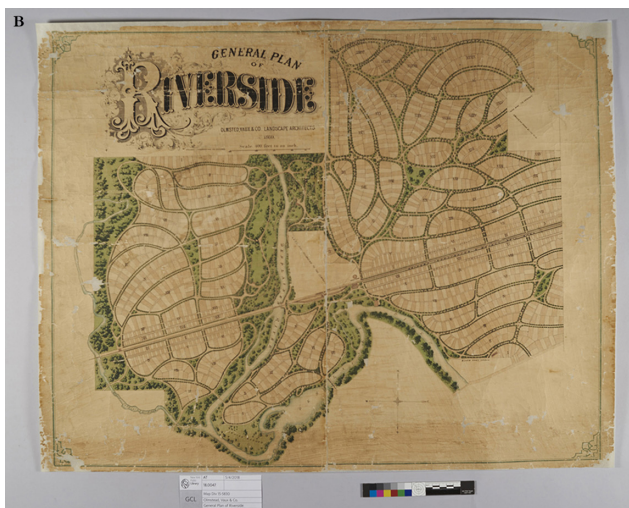
Fig. 6. (a) Before treatment and (b) after treatment. Olmstead, Vaux, & Co., General Plan of Riverside , 1869, NYPL Map Division 15-5830.