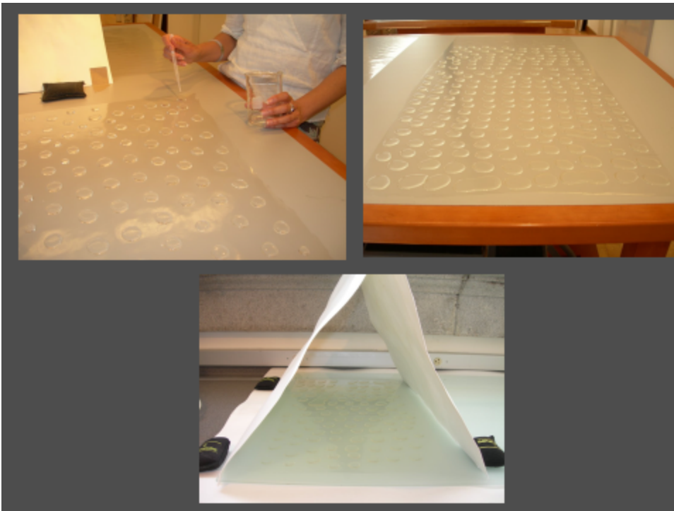
Depositing the liquid onto silicon release Mylar, drying disks