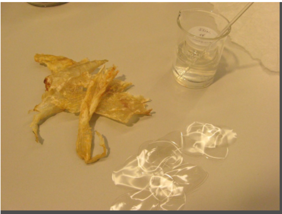
Dried swim bladder, dried and purified disks, and in beaker within a bain-marie