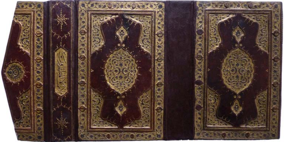
FIGURE 9 A complete Iranian binding (MS UCAD 20072), the exterior, after conservation treatment.