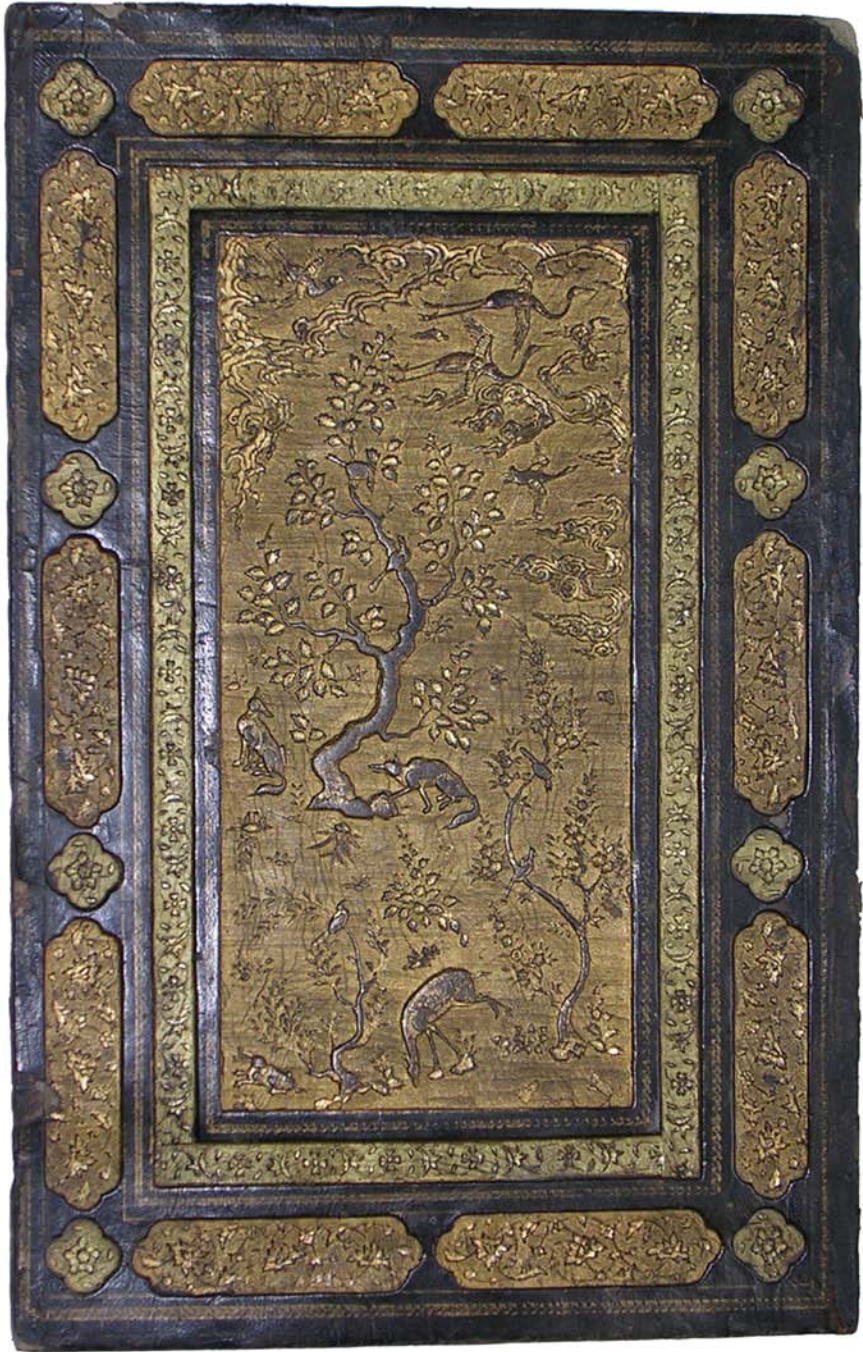
FIGURE 13 An Iranian single board (MS UCAD 8733), the exterior, before conservation treatment.