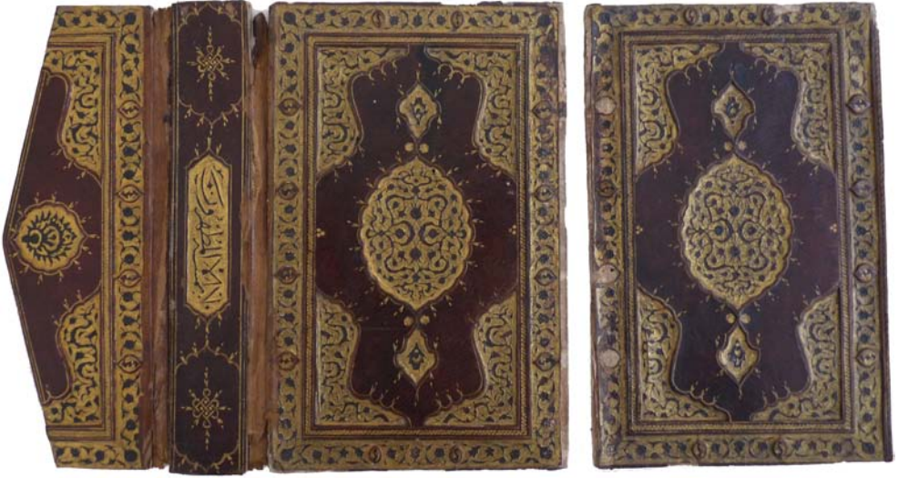
FIGURE 7 A complete Iranian binding (MS UCAD 20072), the exterior, before conservation treatment.