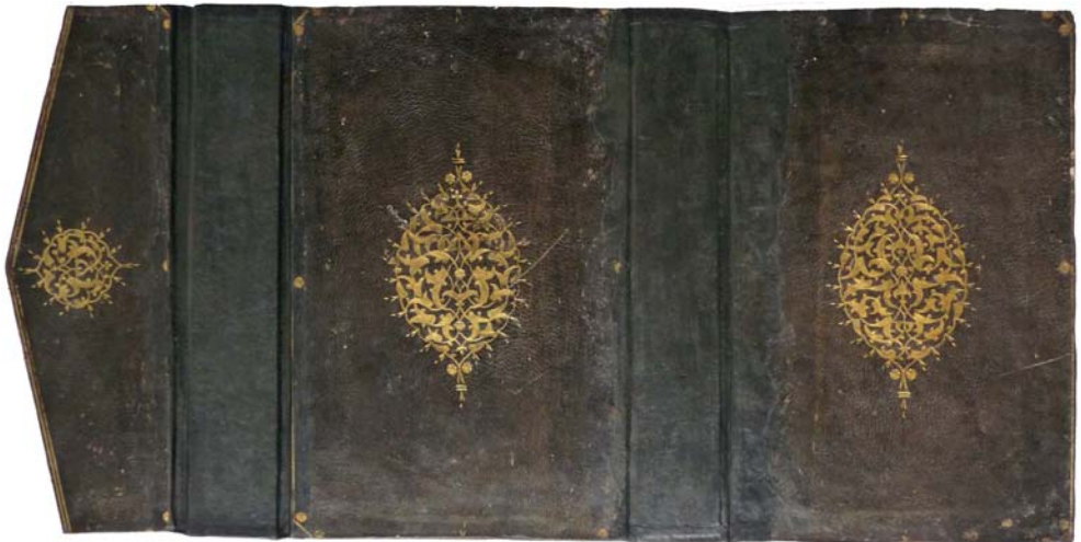
FIGURE 10 A complete Iranian binding (MS UCAD 20072), the interior, after conservation treatment.