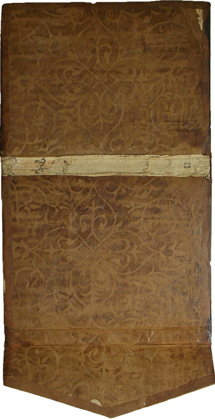
FIGURE 6 A complete Mamluk binding (MS MAO 1209), the interior, after conservation treatment.