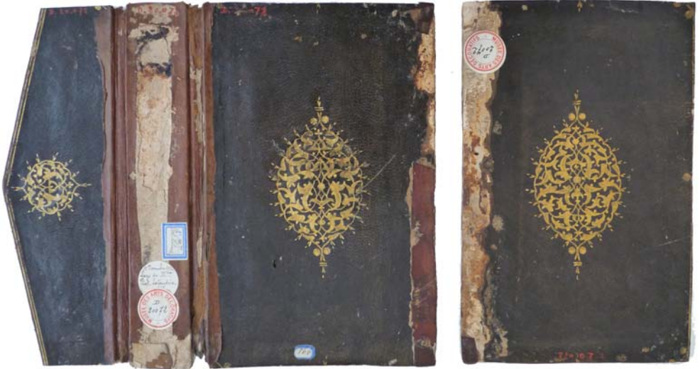
FIGURE 8 A complete Iranian binding (MS UCAD 20072), the interior, before conservation treatment.